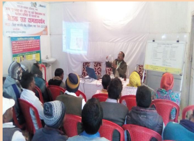
Training of Teachers, ANM & ASHA