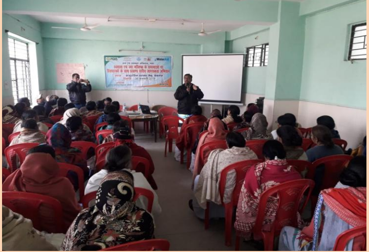
CLTS training of Volunteers